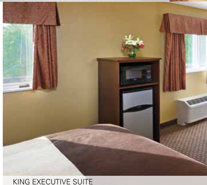
KING EXECUTIVE SUITE