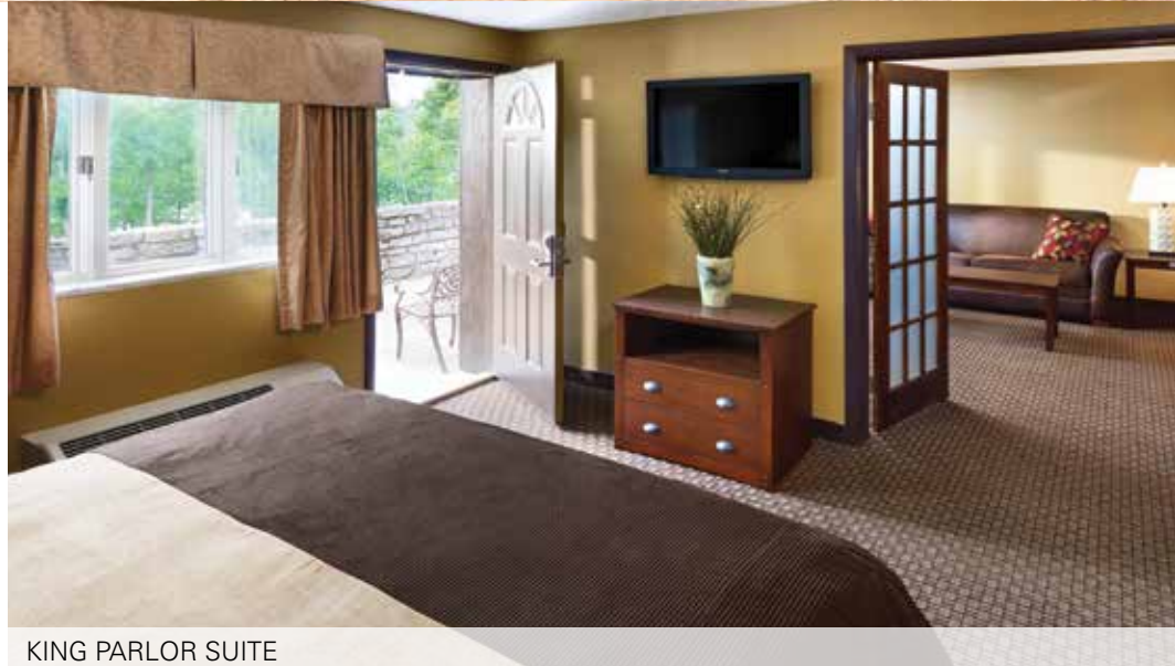
KING PARLOR SUITE