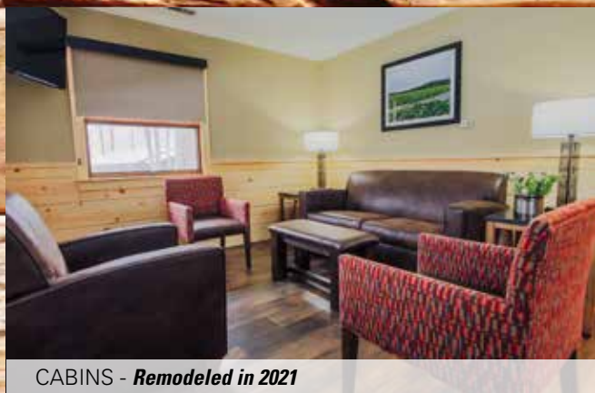
CABINS - Remodeled in 2021