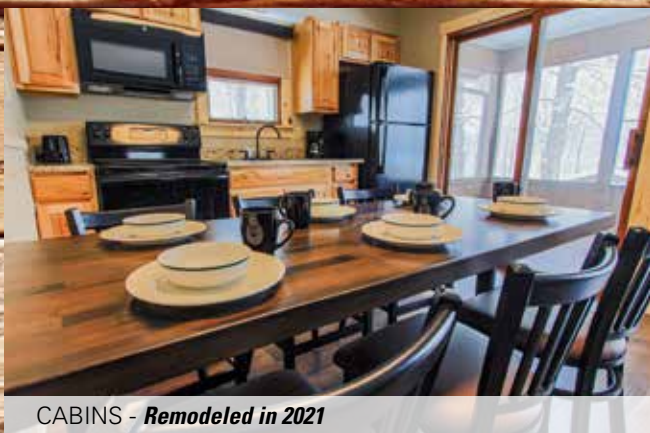
CABINS - Remodeled in 2021